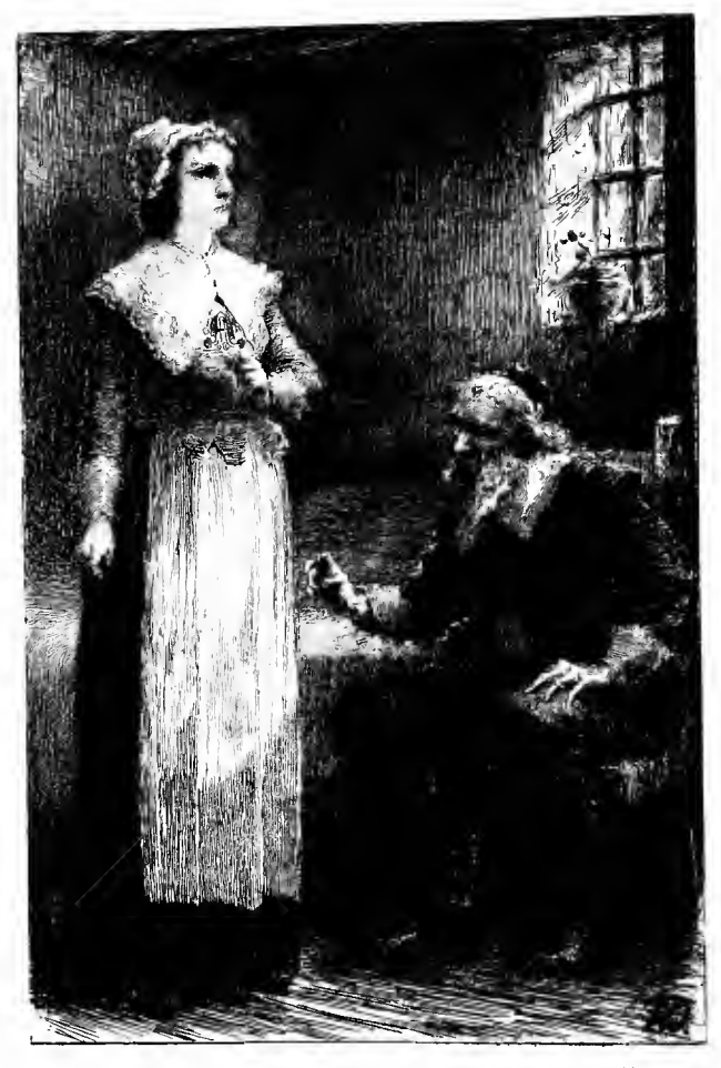
"Sooner or later he must needs be mine!"